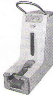
OTO-720 Automatic shoe cover dispenser OTO-702 AUTOMATSKI DISPENZER ZA KALJACE dimenzije 740x320x890

Shoe covers PE and PVC for OTO-702 Automatic shoe cover dispenser